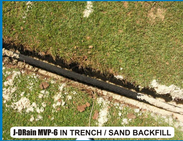
J-DRain MVP-6 IN TRENCH / SAND BACKFILL