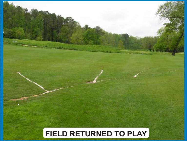
FIELD RETURNED TO PLAY

VERY COST EFFECTIVE: NARROW, SHALLOW TRENCHES CAN BE INSTALLED FOR A FRACTION OF THE COST OF PIPE AND GRAVEL FILLED TRENCHES. LESS INTRUSIVE TO PLAYING AREA.