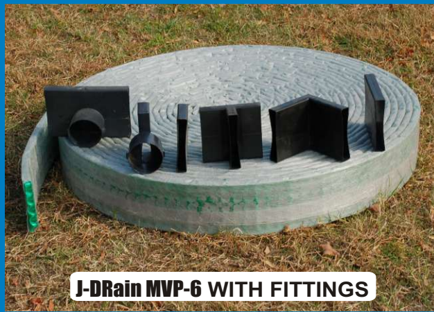
J-DRain MVP-6 WITH FITTINGS