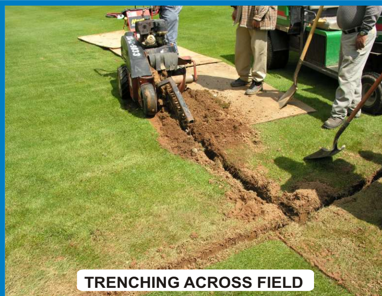
TRENCHING ACROSS FIELD