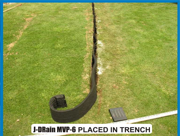
J-DRain MVP-6 PLACED IN TRENCH